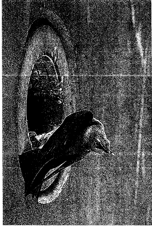
Figure 1. Female Purple Martin with food perching at a wire "nest guard" inserted into a weep hole beneath an elevated freeway in Sacramento, California.

Following fledging, Purple Martin young typically roost at night in the nest cavity for 1 to 12 days (Brown 1997). Because we observed recently fledged young experiencing difficulty reentering weep holes to roost in the evening (see Results), nest guards were also designed to provide a wire ladder to enhance the ability of recent fledglings to reenter holes to roost. We monitored the return of fledglings at the 35th Street site during the post-fledging period in 1992 and 1993 to assess their abilities to enter roost holes with and without nest guards.